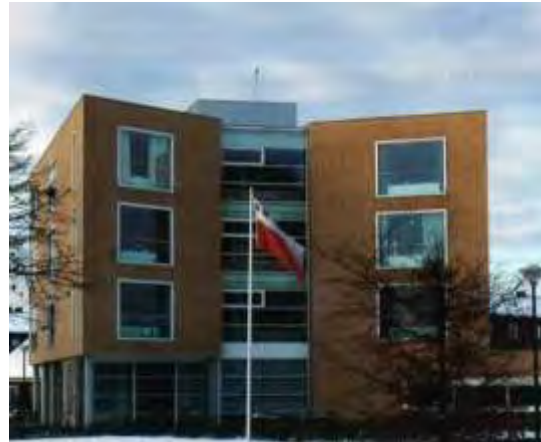
Nursing home W