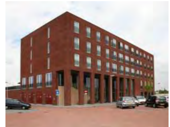
Nursing home I