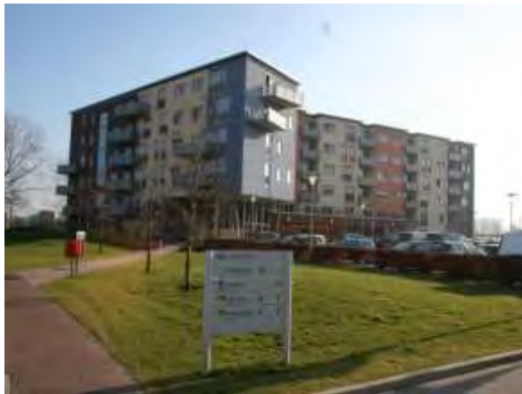
Nursing home Z